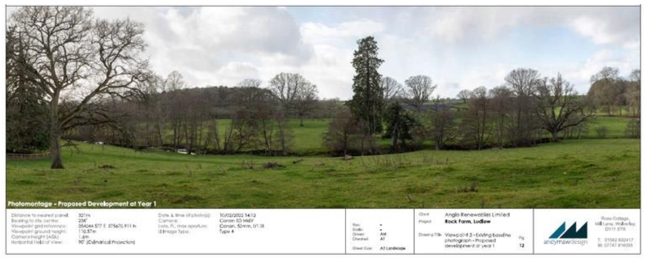
Winter view year 1

Bitterley and Ludford Parish Councils have stated that the same 300m stand-off should apply as for the 2015 'Henley 1' scheme which was approved on appeal. However, the context differs in that Henley 1 came forward under the feed in tariff subsidy scheme whereas the current development has to fund itself in the absence of subsidy. Significant reduction in the array footprint would potentially raise serious viability issues. Also, Henley 1 is due south of the park whereas the current scheme is due west. Additionally, the national context in which renewable energy is considered has evolved over the past 8 years and in 2018 Shropshire Council declared a climate emergency. Any stand-off precedent established by Henley 1 must be seen in this changed context.