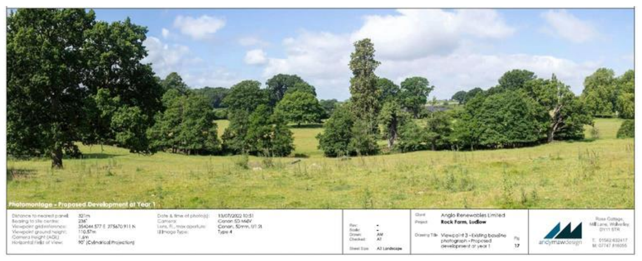
Summer view year 1

In terms of archaeology the Council's archaeology team gave the following response on the proposals in July following the receipt of further archaeological survey information from the applicant: